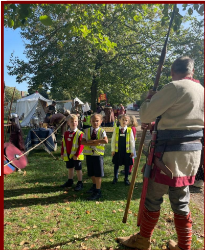
2NK enjoyed a step back in time yesterday during the Chelsea History Festival at Burton Court where they learnt about the history of Chelsea through the ages.