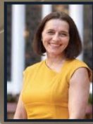
Faith Hagarty More House