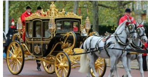
The Diamond Jubilee State

His journey, in special carriages, will take him from Buckingham Palace, along The Mall to Trafalgar Square, along Whitehall to Parliament Square and then to Westminster Abbey.