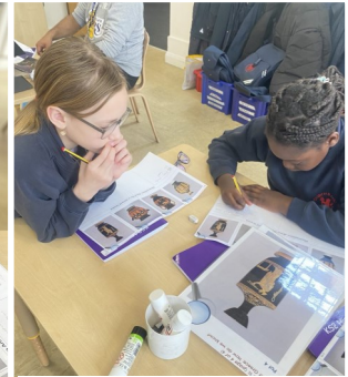
Year 5 History