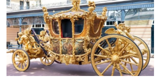
The Gold State Coach