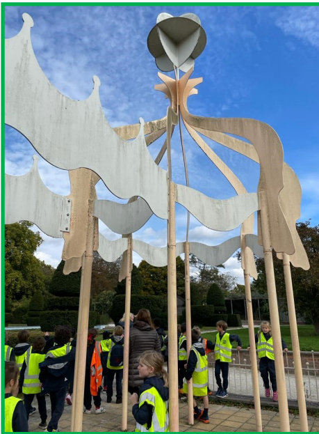
3NK's Sculpture Tour Of Battersea Park with Nadia Marchant.