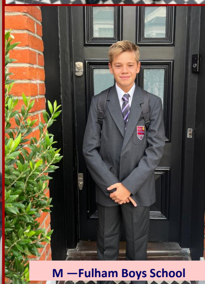
M — Fulham Boys School