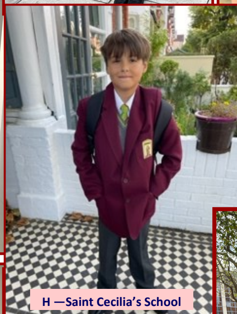
H — Saint Cecilia's School

If you are an ex Christ Church pupil and you have just started your new school, you are very welcome to share a photo with us in your new school