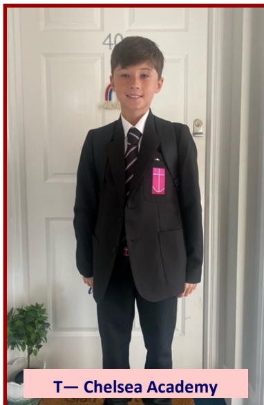
T — Chelsea Academy

Children who graduated from Y6 in the summer have now started their new schools. Here are some lovely pictures of them looking very smart in their new school uniforms.