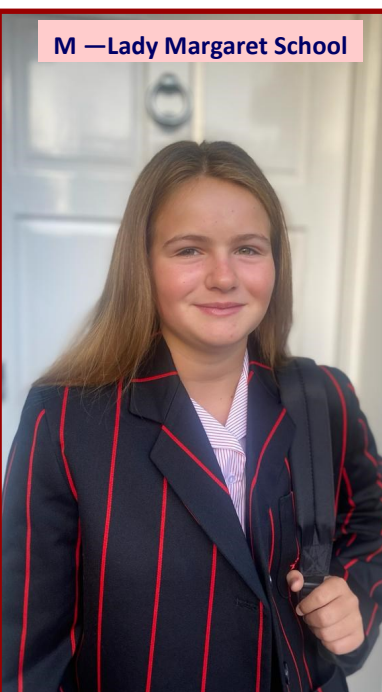
M — Lady Margaret School

If you are an ex Christ Church pupil and you have just started your new school, you are very welcome to share a photo with us in your new school