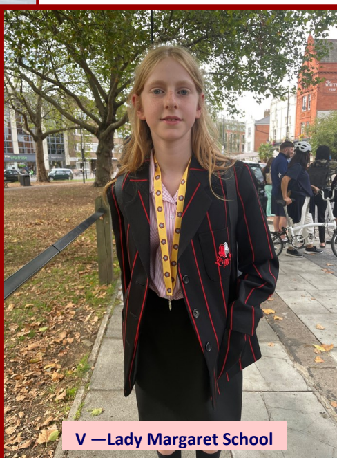
V — Lady Margaret School