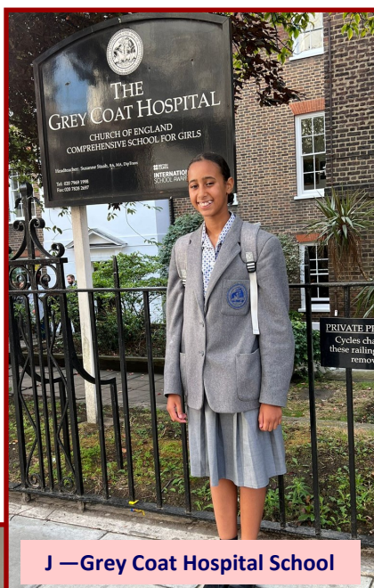
J — Grey Coat Hospital School