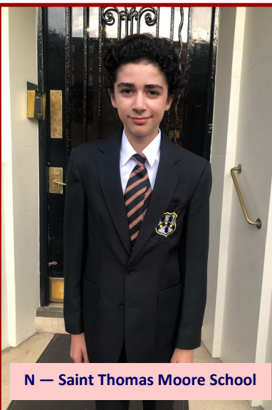
N — Saint Thomas Moore School